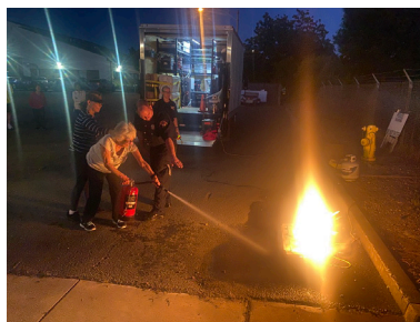
ALCO Fire showing proper fire extinguisher use at recent CERT training