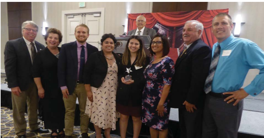
Group Award: Puente Project

Congratulations to the Viola Blythe Award Winners!