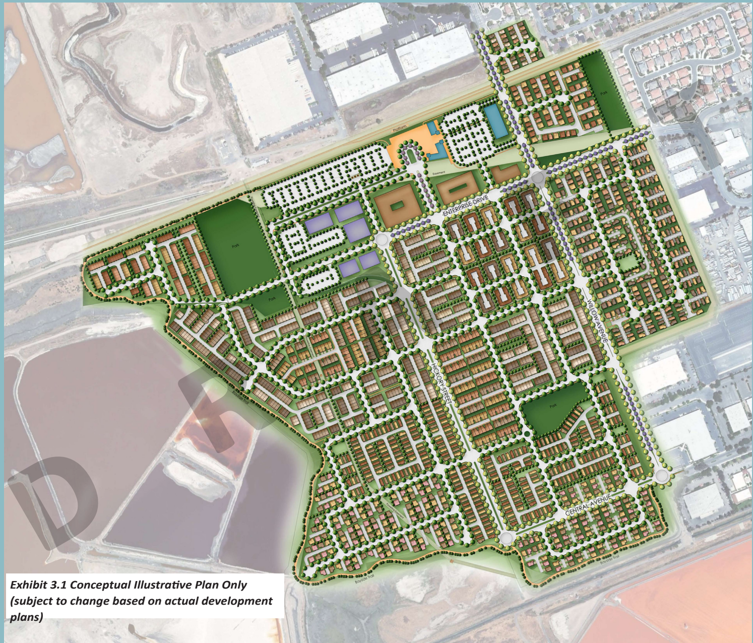
Exhibit 3.1 Conceptual Illustrative Plan Only (subject to change based on actual development plans)