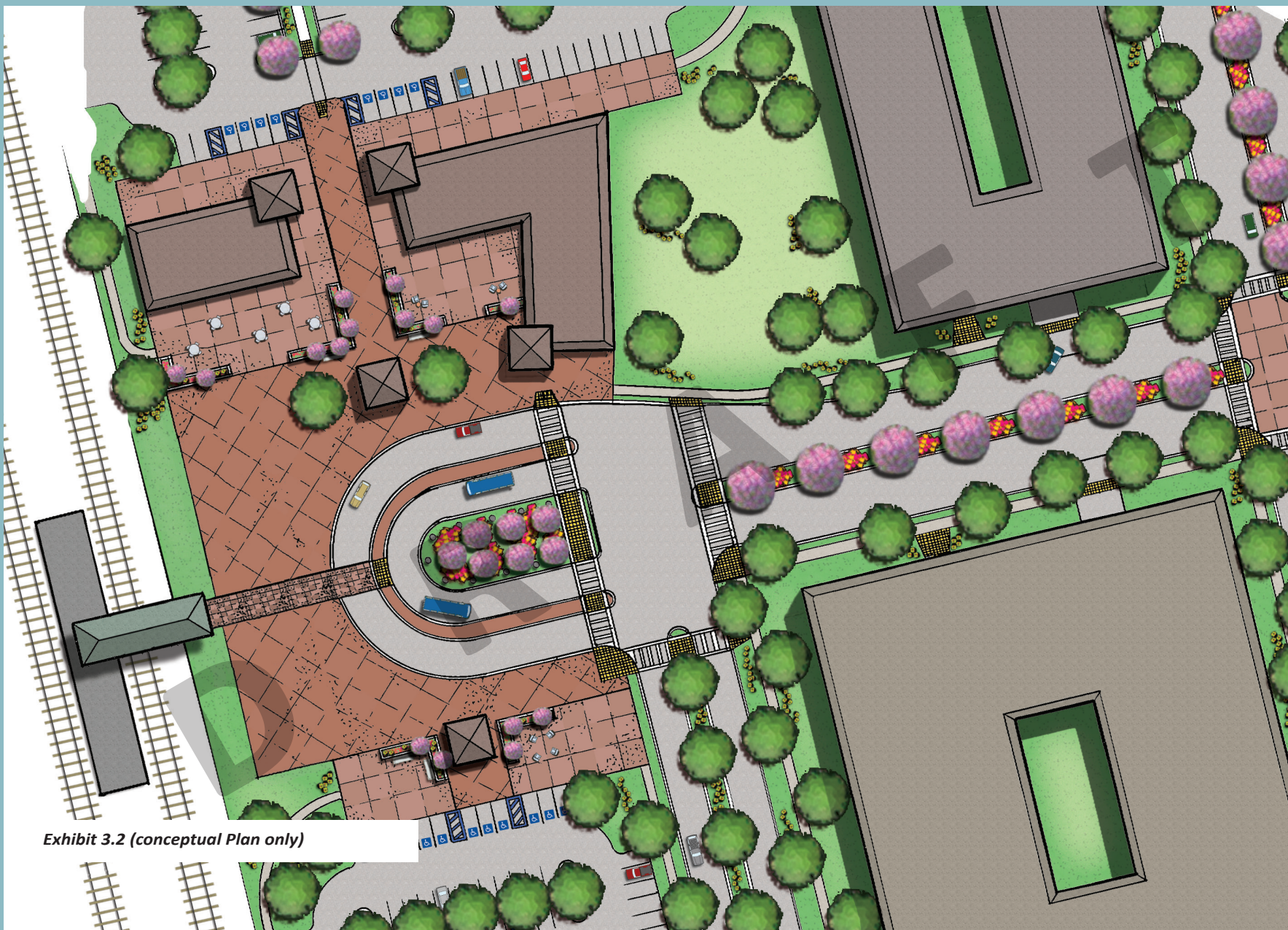
Exhibit 3.2 (conceptual Plan only)