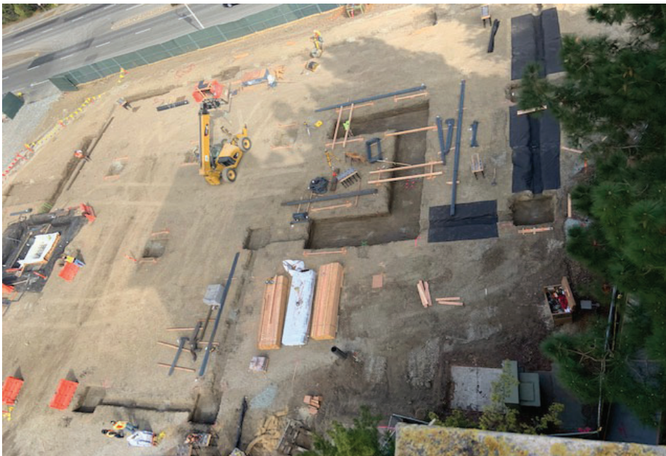
Foundation preparation at City Hall