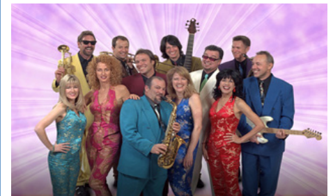
The Big Bang Beat