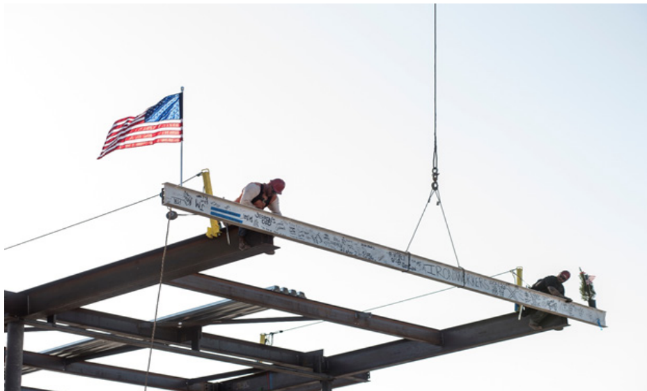
Topping Out ceremony as the last beam was placed on the last building of the Newark Civic Center.