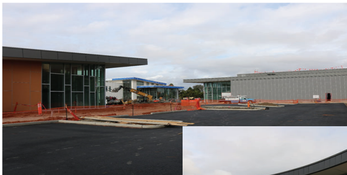
View of the plaza and the lobby to all three buildings from the parking lot