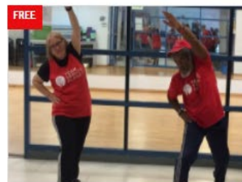
TUE JUNE 1 | 1:00PM-1:30PM PDT Afternoon Stretch

Share your experience with holistic wellness. Hosted by Senior Planet NYC