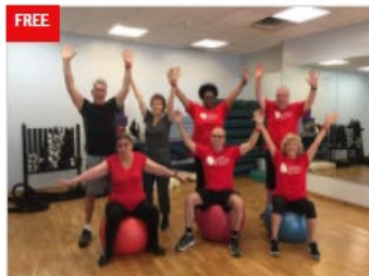
THU JUNE 3 | 6:00AM-7:00AM PDT Balance/Strength

Get your heart pumping during this fun, high-energy workout! Hosted by Senior Planet NYC