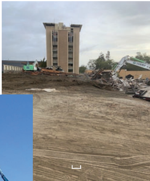
The tower minutes before demolition began.