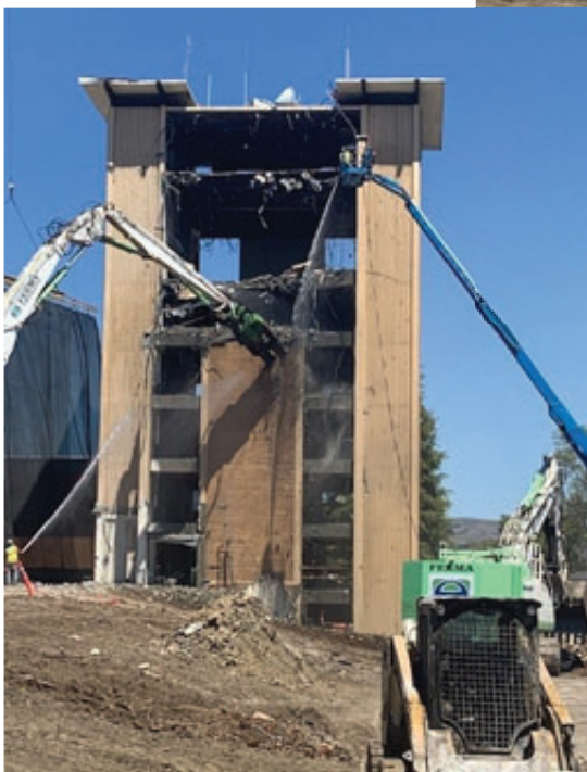
The tower about 30 minutes after demolition began.

可以在我们的网站上找到中文版本： https://www.newark.org/departments/newark-news/newark-news-translated/-fsiteid-1 .