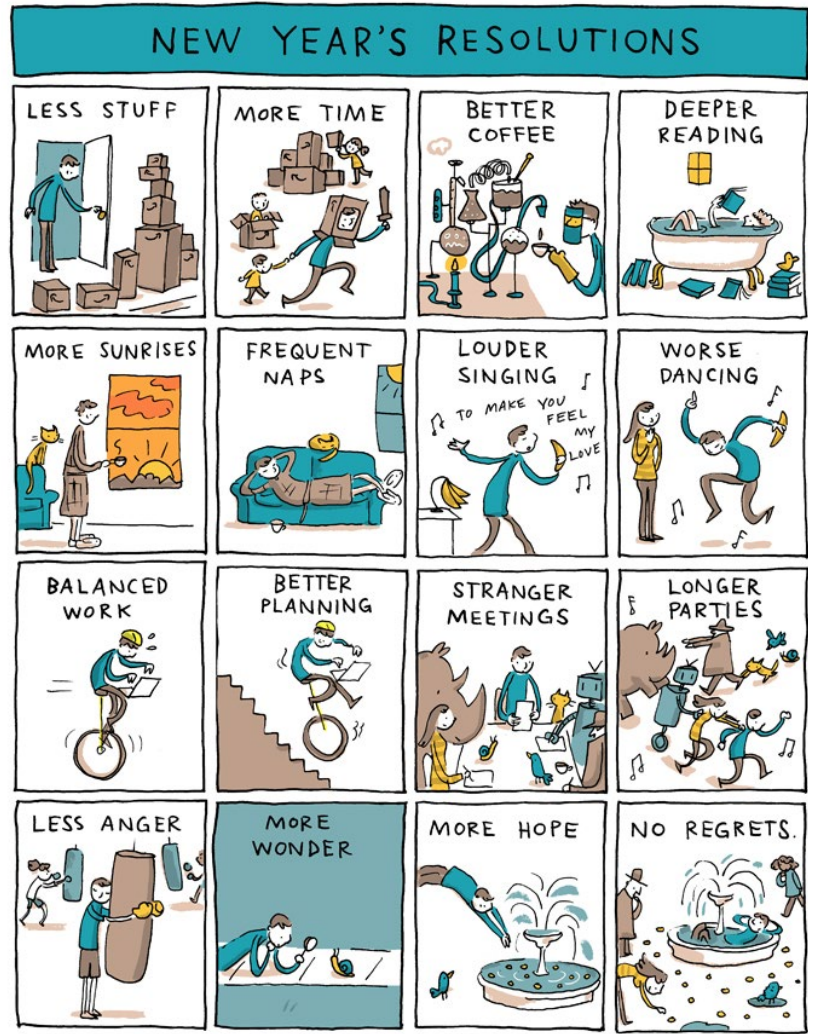
GRANT SNIDER FOR EVERNOTE