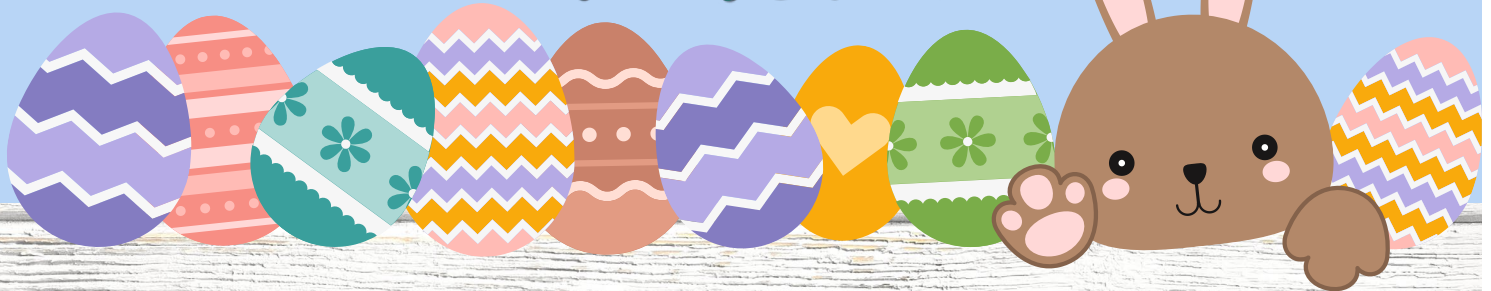
Photo Booth * Arts & Crafts * Games * Egg Dyeing Chalk Art * Community Resource Fair